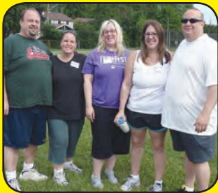
JUNE 26, 2011

Five Toledo-area Jews have made a commitment to changing their lives. They have gained a lot by losing weight. Over the course of seven months, they have moved closer to their goal of living a healthier, more active lifestyle.