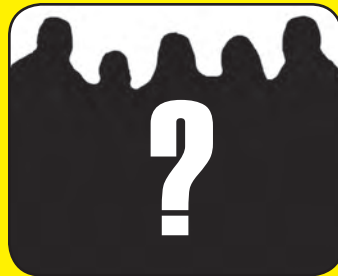
JANUARY 12, 2012

Hear the CHAI FIVE speak about their life-changing journeys and celebrate their achievements. At the event we will reveal their weight-loss successes and the total raised for charity.