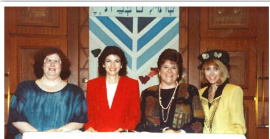
photo depicts the B'not Mitzvah group from 30 years ago