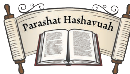
TORAH PORTION OF THE WEEK

No experience? No problem! No specific skills are required to volunteer and make a difference. Please note: The scope of work is subject to change due to scheduling or other project adjustments. We can't wait to build with you!