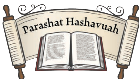
TORAH PORTION OF THE WEEK

Join us each Friday morning to discuss and learn the weekly Torah portion with fellow CBI members and friends