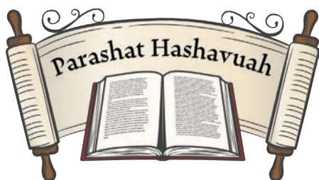
TORAH PORTION OF THE WEEK