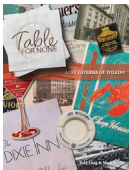
Table for None: Lost Eateries of Toledo